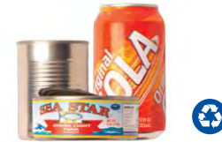
Food & Beverage Cans No loose lids