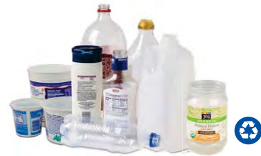
Plastic Bottles, Jugs, Jars & Dairy Tubs No lids

Recycle the below items at drop-off locations.