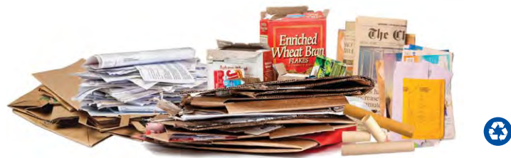
Paper, Flattened Cardboard & Paperboard