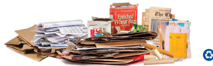
Paper, Flattened Cardboard & Paperboard