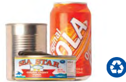
Food & Beverage Cans No loose lids