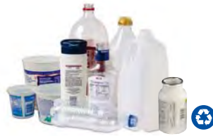
Plastic Bottles, Jugs & Tubs

Please do not bag. Place these loose items in your recycling cart. Recyclables should be empty, clean & dry.