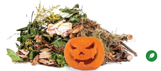
Plant Debris and Yard Trimmings

These materials go in your green organic waste cart.