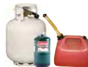
Fuel & Flammables