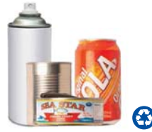
Food, Beverage & Empty Aerosol Cans