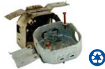
Scrap Metal (small items only)