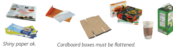
Shiny paper ok.