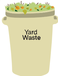
32 Gallon Can