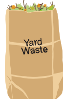
Kraft Paper Bags