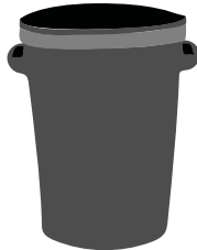
32 Gallon Can with lid