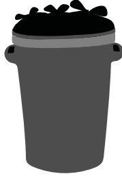
32 Gallon Can