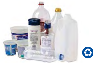
Plastic Bottles, Jugs, Jars & Dairy Tubs

All items must be clean, empty and placed loose in the recycle cart. Recycle only these items.