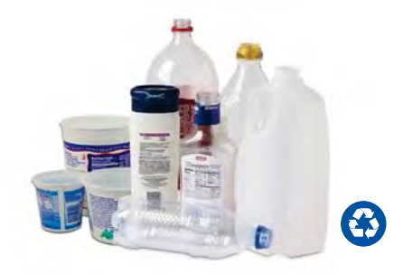
Plastic Bottles, Jugs & Tubs

Please do not bag. Place these loose items in your recycling cart.