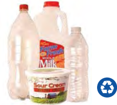
Plastic Bottles, Jugs and Tubs

All items must be clean, empty and placed loose in your recycle cart. Do not bag recycling.