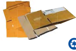
Flattened Cardboard & Paperboard