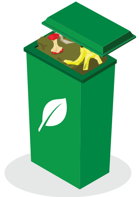
23 Gallon Compost Bin