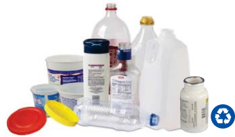
Plastic Bottles, Jugs, Tubs & Lids over 3"

Please do not bag. Place these loose items in your recycling cart. Recyclables should be empty, clean & loose .