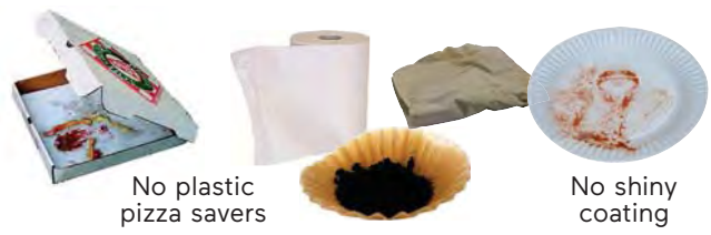
No plastic pizza savers