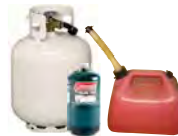
Fuel & Flammables